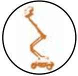
Knuckle Boom Lifts