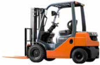
Toyota 2.5T Forklift