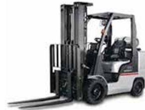
Nissan 2.5T Dual Fuel Forklift